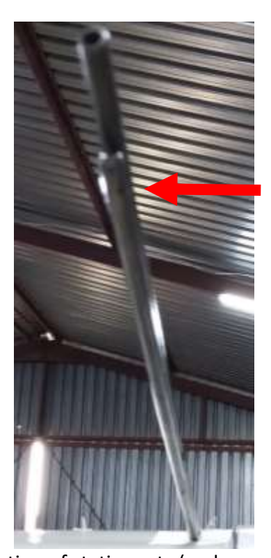
Figure 1: Location of static ports (on lower tube)