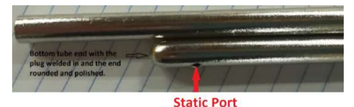
Figure 2: Close-up of static port (one visible, not installed on aircraft)