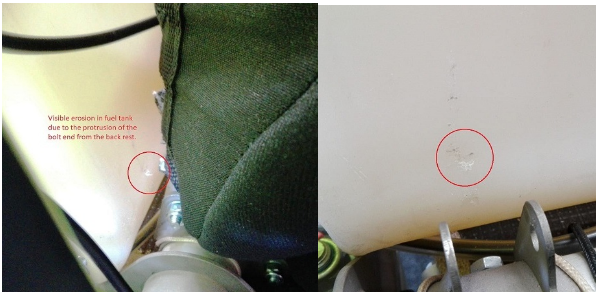
Figure 2: Fuel tank showing eroded region