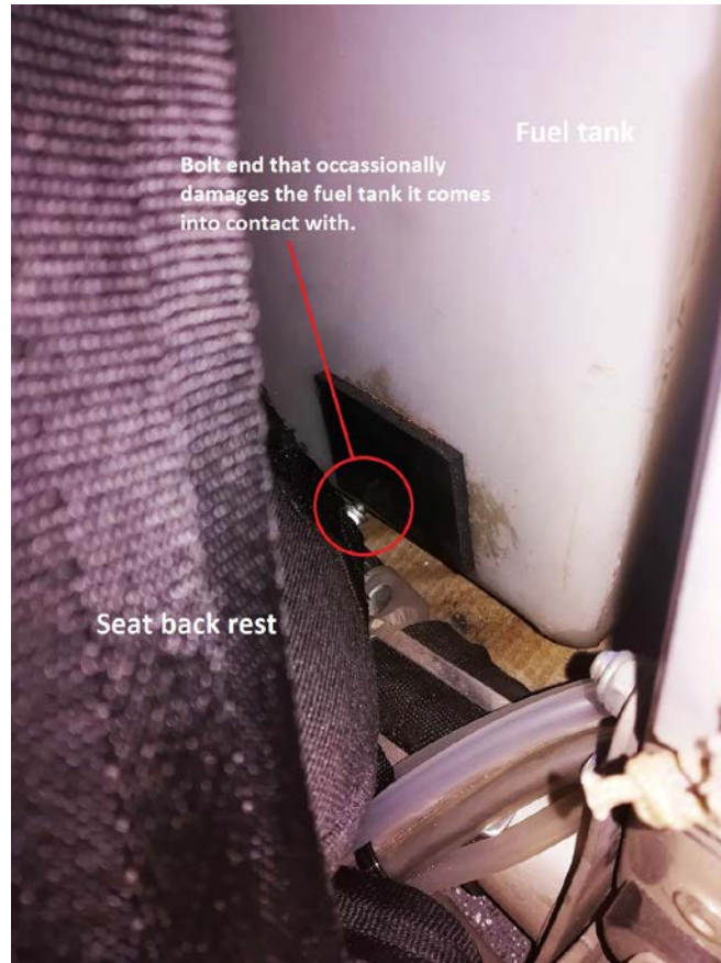
Figure 3: Detailed view of bolt protruding from back rest and coming into contact with fuel tank